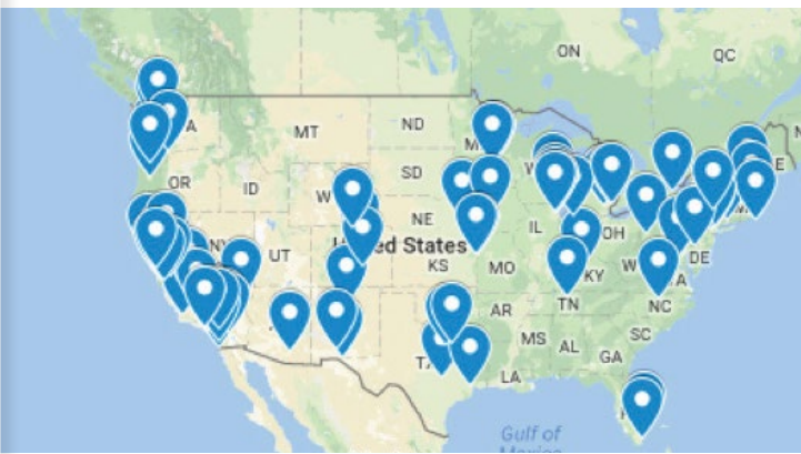
Safe Zone School Districts Map

CAPE Grantees focused on DACA and supporting immigrant students inspired local affiliated across the country to pass "Safe Zone" School Board Resolutions for immigrant students.